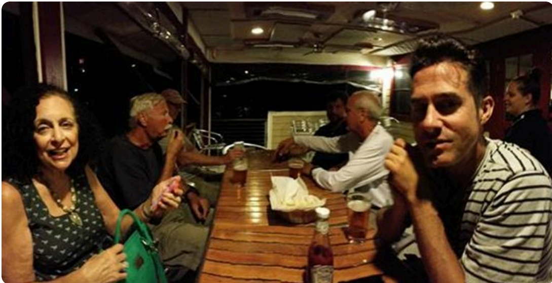
Having popcorn and beer at the Eastport Yacht Club after a long hard day of sailboat racing...