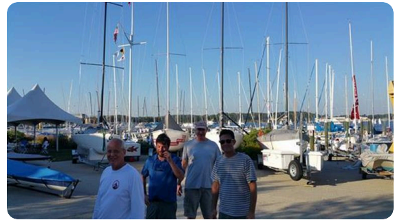
Arriving at the Annapolis Eastport Yacht Club to race in the 2016 J-30 Nationals Regatta