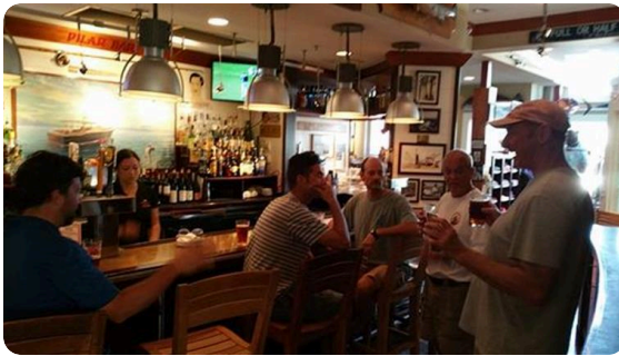
The "POGO" team celebrating another amazing Annapolis Regatta