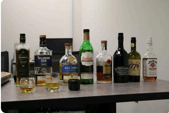
NASA Toast to Rick