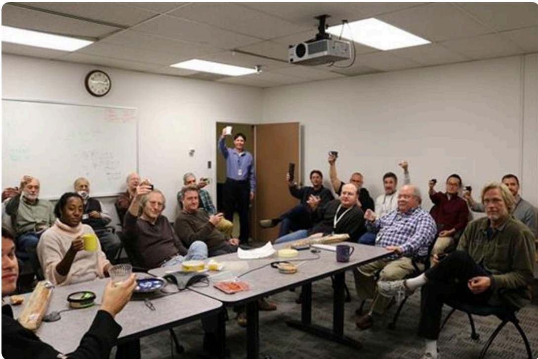
He will be missed